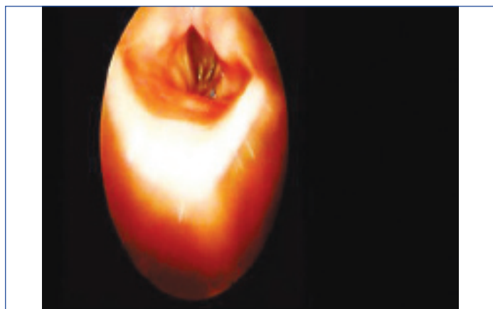
[Table/Fig-3]: Endoscopic image showing bhurut on left vocal cord.

The time of presentation in patients with bhurut in the aerodigestive tract varied from three hours to five days. In 18 (85.71%) cases, the diagnosis was formulated within three to six hours after the ingestion, and in the remaining three (14.28 %) cases delay of more than 24 hours was reported. Among the patients, the most common symptom was foreign body sensation (100%) [Table/Fig-4].